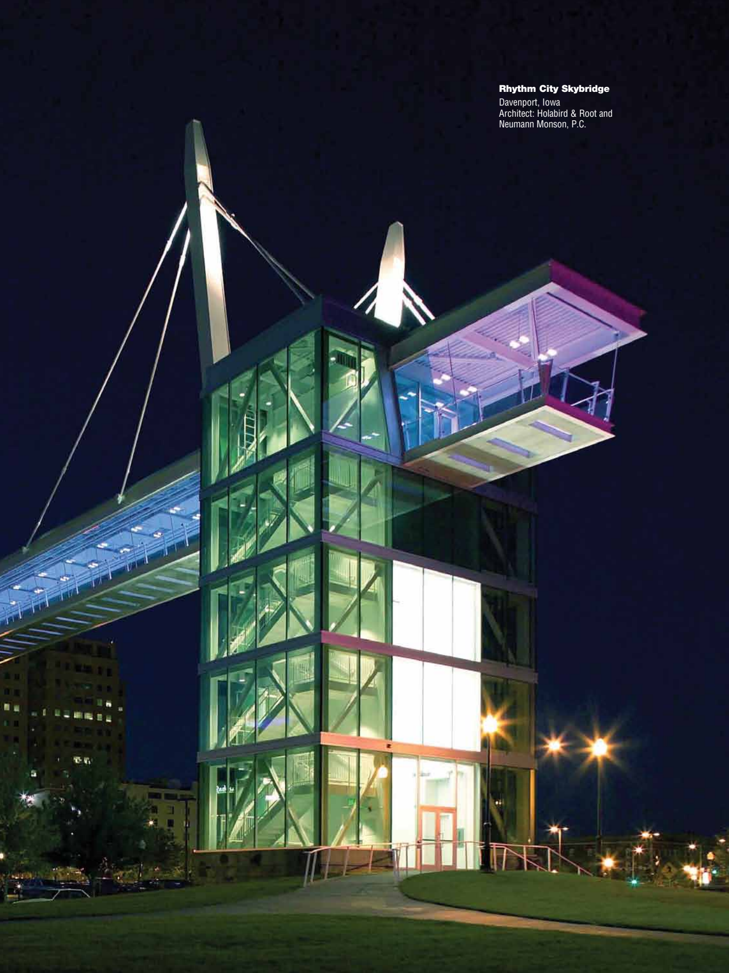
Rhythm City Skybridge Davenport, Iowa Architect: Holabird & Root and Neumann Monson, P.C.