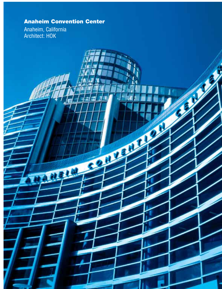
Anaheim Convention Center